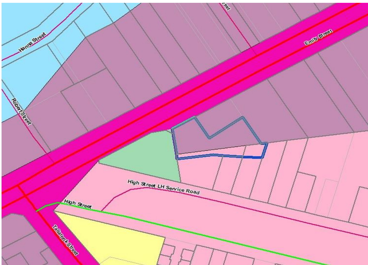
Figure 1: Current zoning map of the subject site