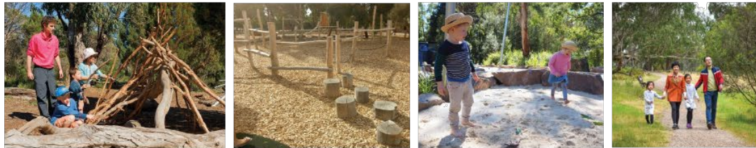
Reference images showing possible features and landscape character: subject to consultation, budget and detailed design.