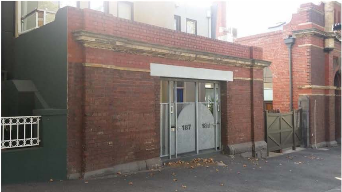
Heritage façade incorporated into modern development; North Melbourne