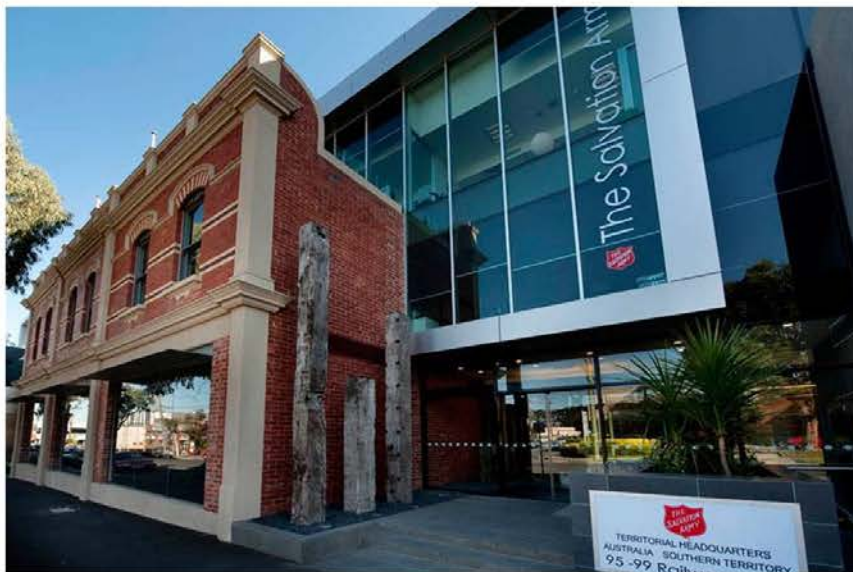
Salvation Army - Victorian Headquarters, Railway Road, Blackburn