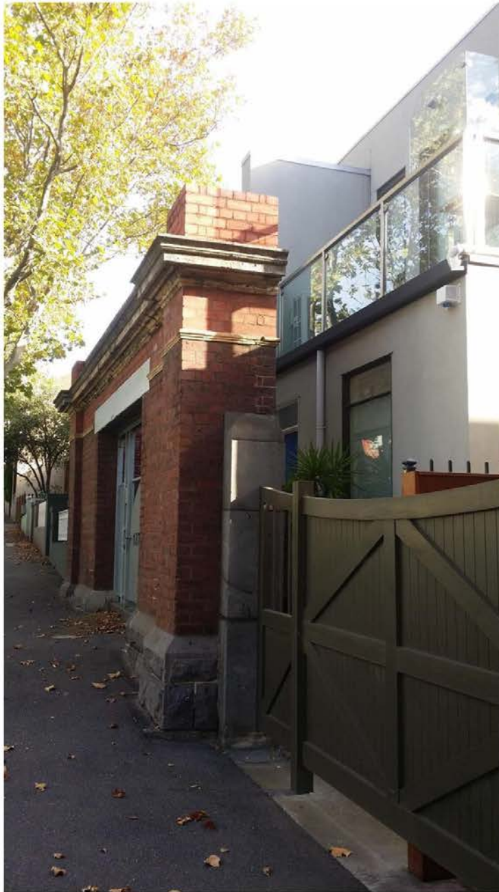
Heritage façade incorporated into modern development; North Melbourne