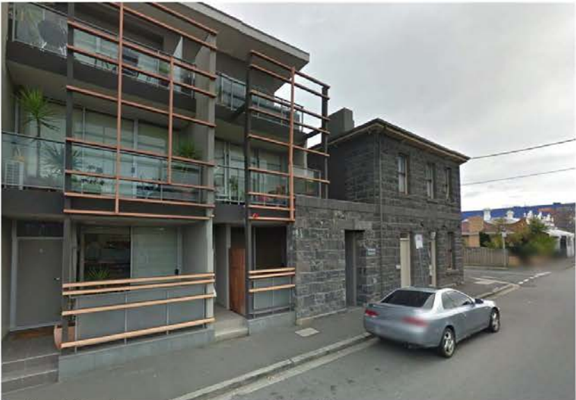
Residential Development, Ballarat Street, Yarraville