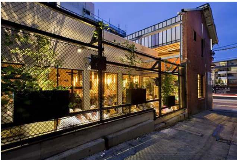
Newmarket Hotel, Inkerman Street, St Kilda