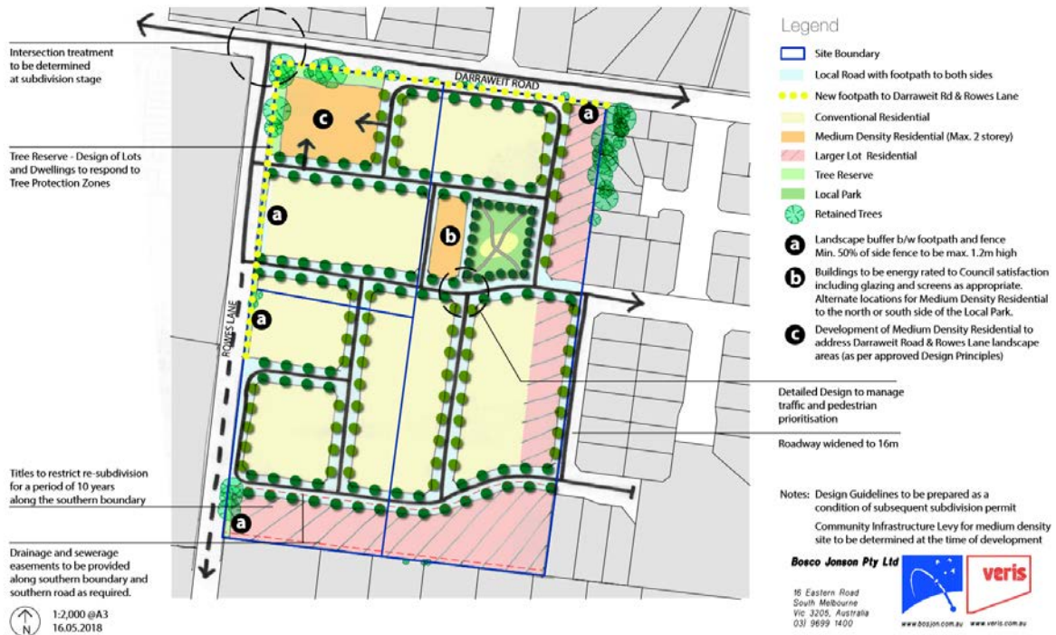
Figure 2: Development Plan

The proposed Development Plan is supported by a range of supporting documentation, including the following;