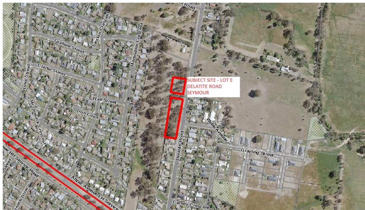
Figure 1 - Subject site and wider area