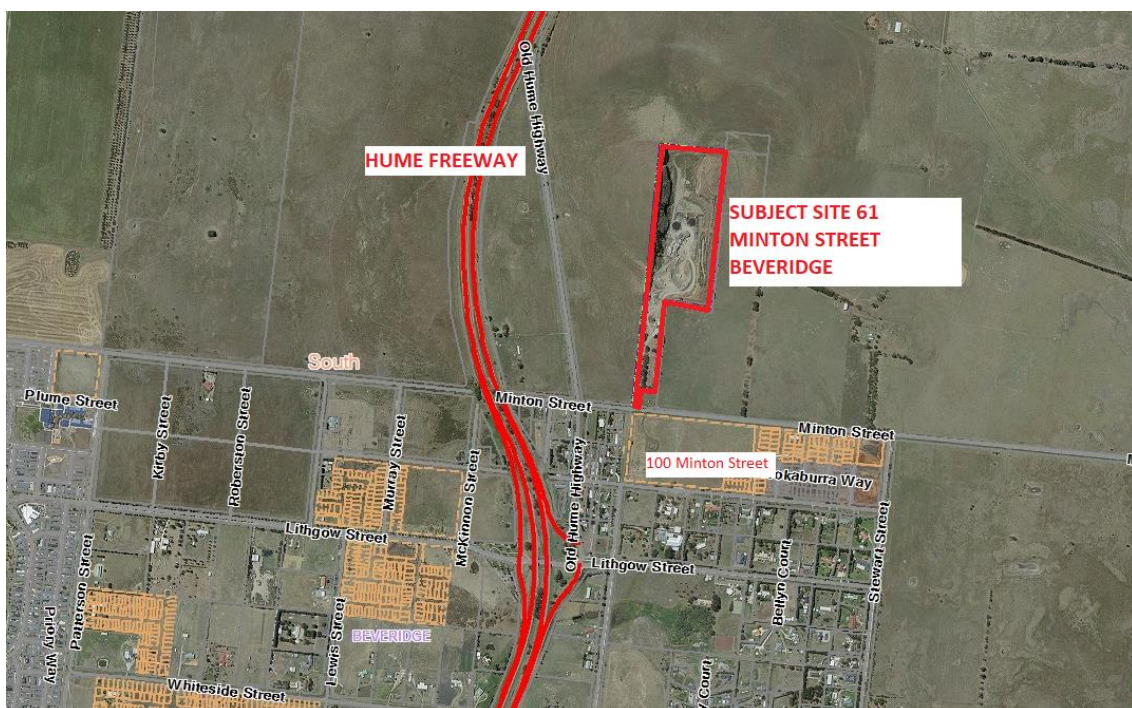
Figure 1. Subject site and surrounds