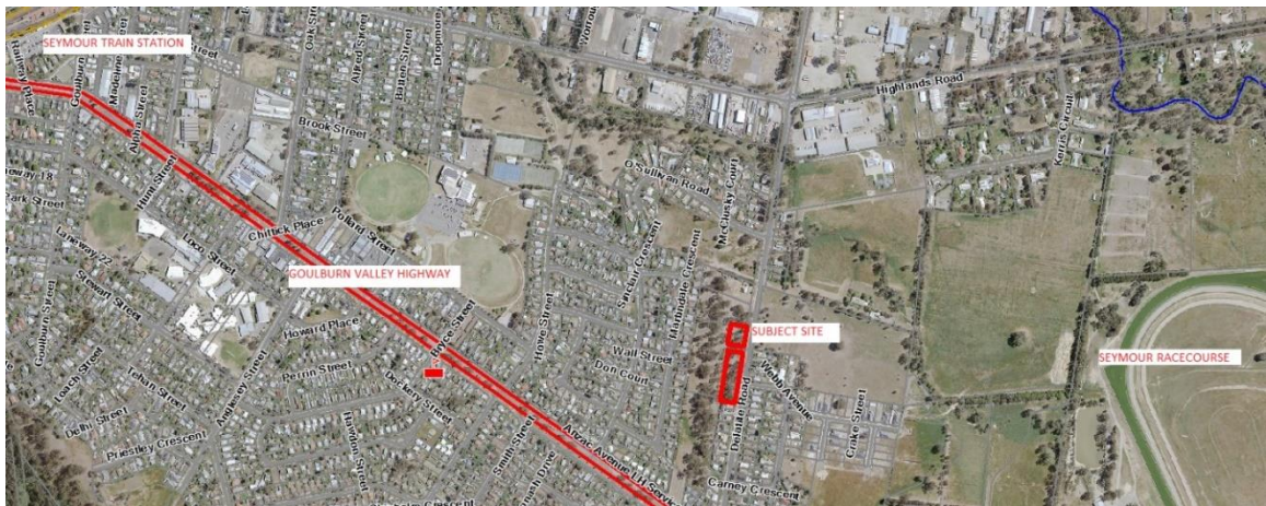
Figure 2 - Subject site and wider area

PLANNING PERMIT APPLICATION PLP202/20 FOR NATIVE VEGETATION REMOVAL AT LOT E DELATITE ROAD, SEYMOUR (CONT.)