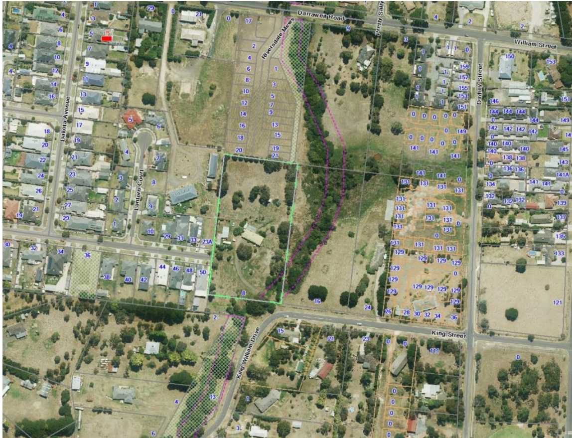
Figure 1 - Aerial of the subject site and surrounding properties