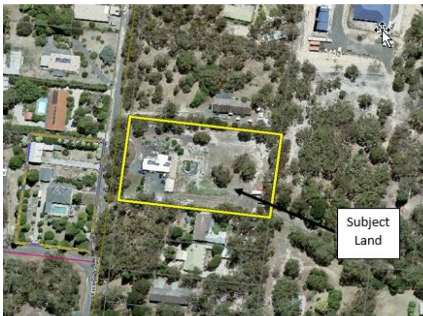
18 Eucalypt Grove