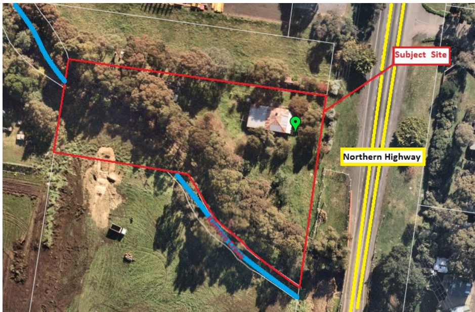
Image 1. Aerial of 111 Northern Highway, Kilmore