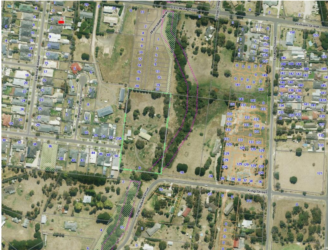
Figure 1 - Aerial of the subject site and surrounding properties