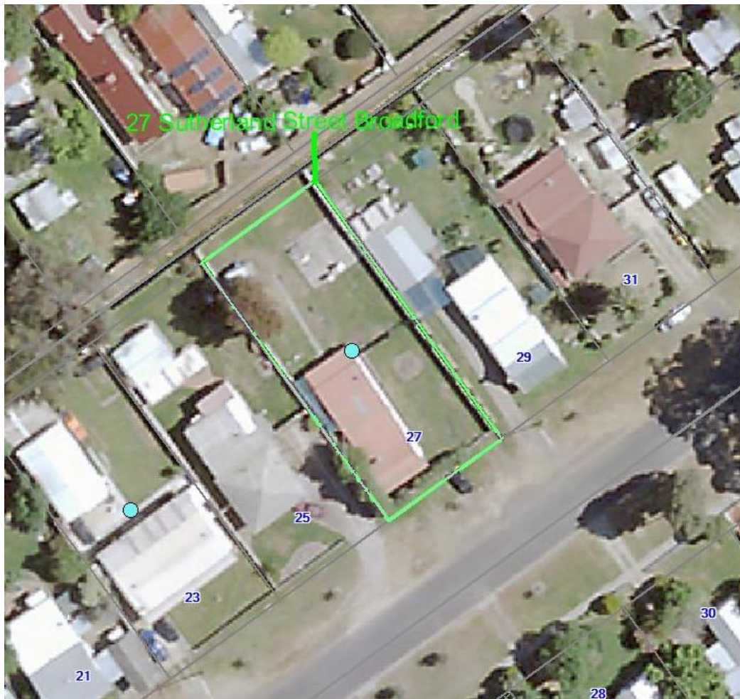
Figure 1: Aerial image of the subject site at 27 Sutherland Street, Broadford – Exponare 2020