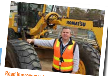
Road improvements program