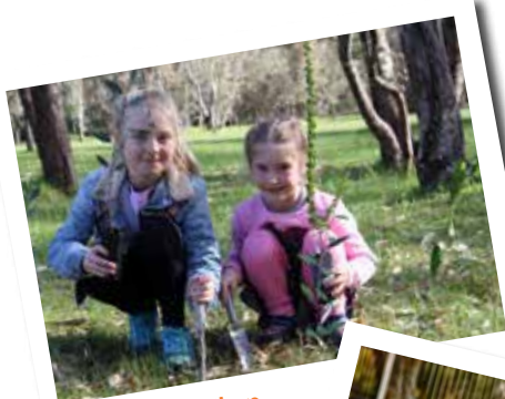
More tree plantings