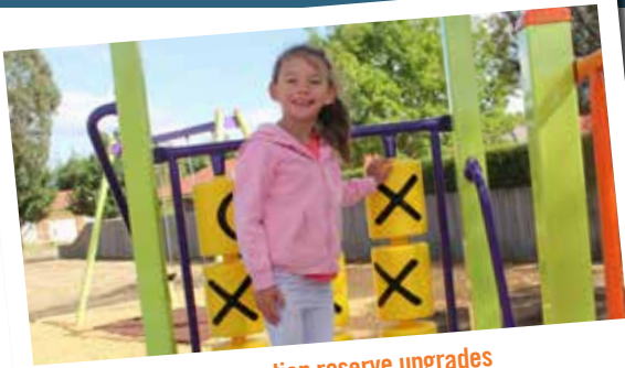
Play space and recreation reserve upgrades and improvements