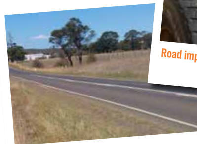
Footpath missing links program